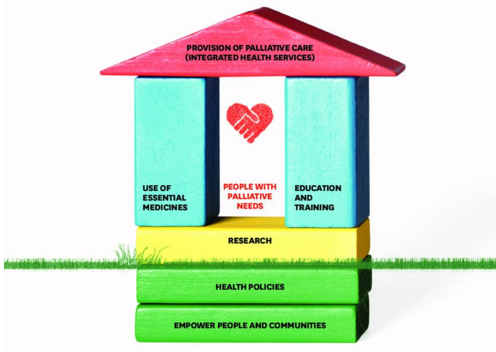
Figure 1: WHO Conceptual Model of Palliative Care Development

Palliative care has emerged over the past fifty plus years as a new specialization in healthcare that is considered an essential component of every healthcare system and a part of the continuum of universal healthcare (promotion, prevention, treatment, rehabilitation and palliative care). The philosophy behind it is mainly grounded in humanism and existentialism and requires that people with palliative care needs are treated compassionately as whole persons with a universal focus on physical, psychological, social, spiritual and practical needs. Care is interdisciplinary typically including nursing, medicine, social work, chaplaincy and volunteers. By interdisciplinary we mean not hierarchically organized but person-centred where the patients and families are at the centre of care and their goals drive the way care is delivered.